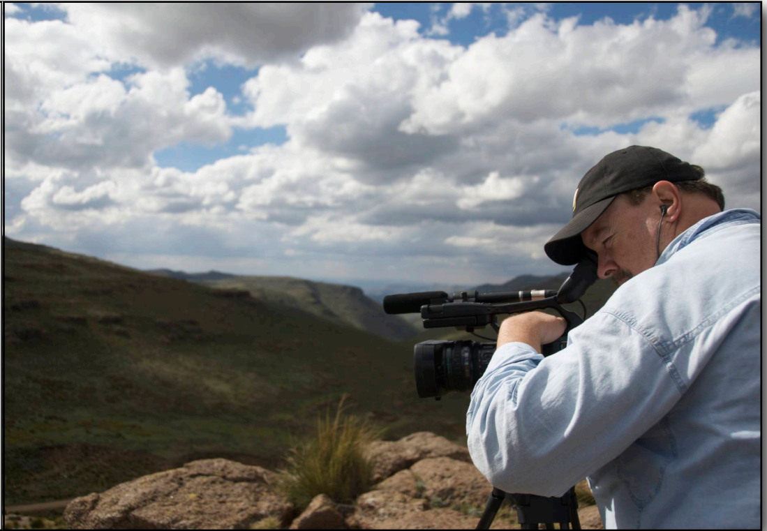
Filming on location in the highlands of Lesotho.