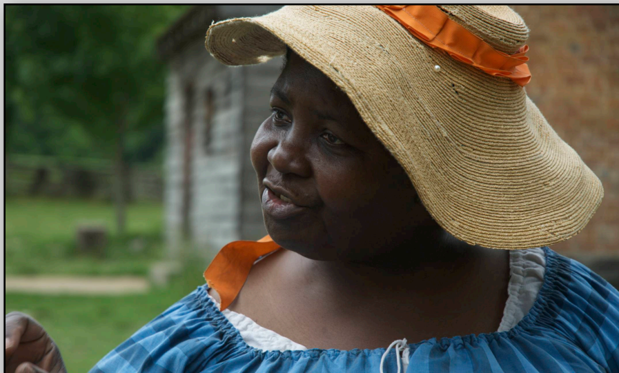
Shot on location in Williamsburg, VA.

Even the most gifted among us can accomplish more when depending on God.