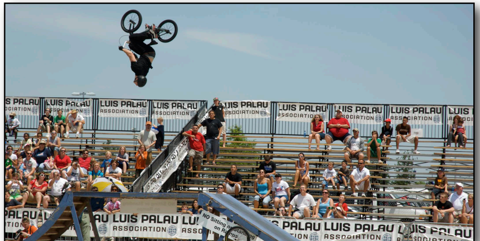
Documenting domestic ministry outreach can be just as much of a leap as foreign missions.

Daylight Media is an outsource service provider focused on helping meet these needs. Outsourcing is a strategy that has been used in the corporate world for a long time when businesses contract with an outside, independently owned service provider to perform specialized services.