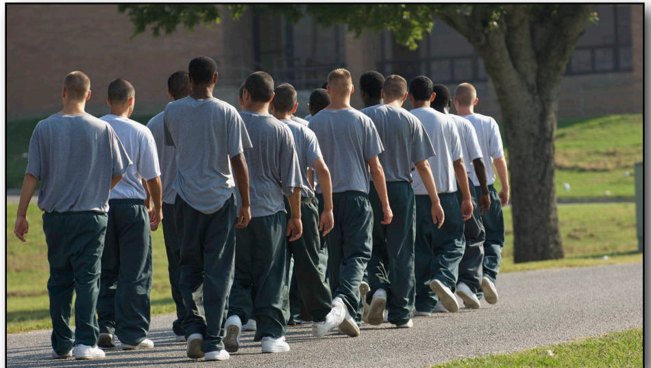
Knowing the ground rules is always important, especially when filming in unique locations like this juvenile correctional facility in Texas.

An additional advantage of having video on client websites is that video content produces higher placement in internet search results - called search engine optimization or SEO. All of this has the potential of attracting more